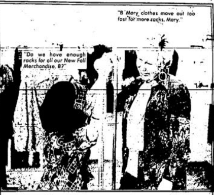
The B-MARY SHOP PONDEROSA INN, Burley, Idaho